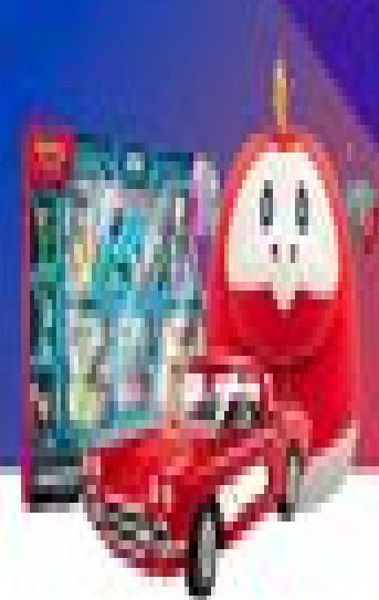
Select toys and collections