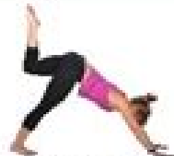
Knee Circle (step 2)