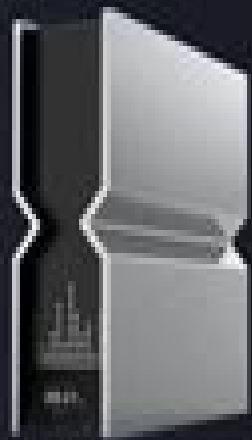
Wi-Fi 7 Routers