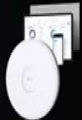
Omada Enterprise Wi-Fi 7 Access Points