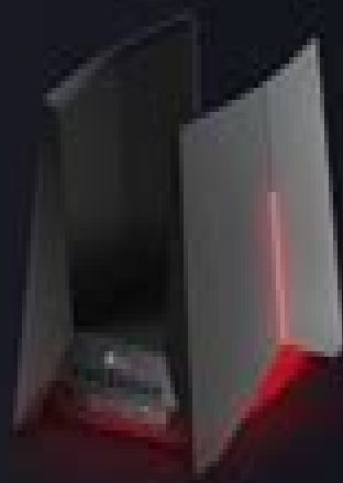
Wi-Fi 7 Gaming Routers