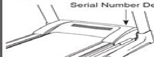
Serial Number Decal

Find the serial number in the location shown below. Write the serial number in the space above for reference.