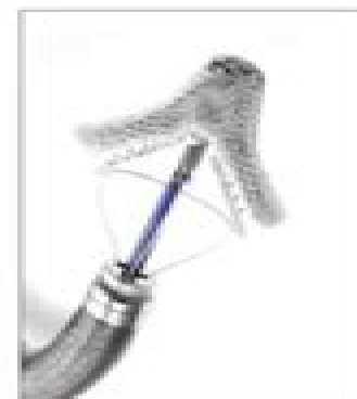
Figure 2. Le clip, en cobalt-chrome, de 15 mm de long.

les comorbidités, l'insuffisance rénale ou bien encore la fraction d'éjection du ventricule gauche (FEVG) du patient sont discutés entre le cardiologue interventionnel, le chirurgien cardiaque et l'échographiste.