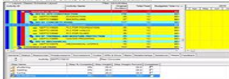
Fig. 1: Activities

It is a monitoring tool for monitoring the progress of project in terms of the cost, resource allocation.