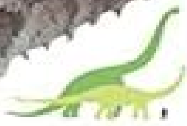
Size and scale