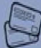
Federal student loans