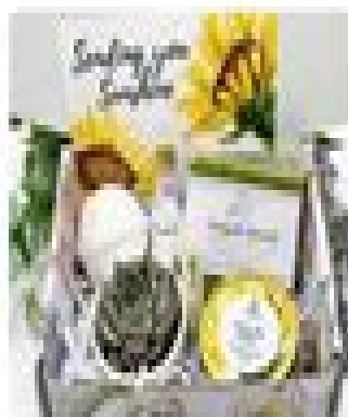
Thinking of You - Succulent Gift Box - Missing You - Friendship...