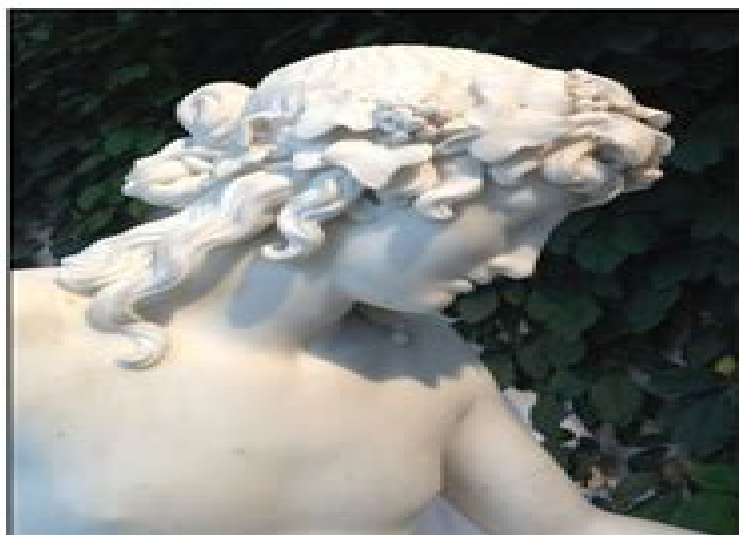
Bacchus by Erik Gustaf Göthe, 1805 - creative commons