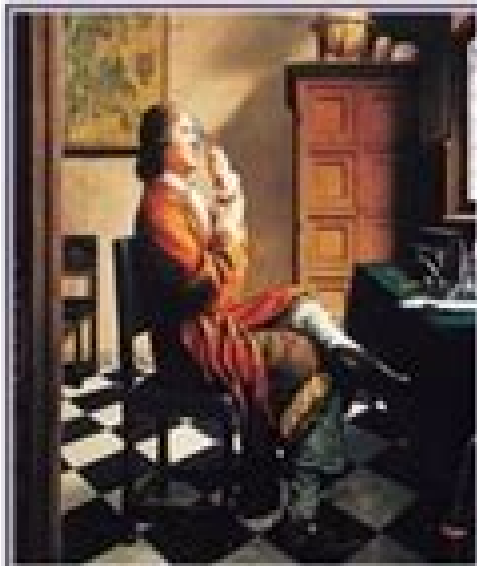
(a) Van Leeuwenhoek using his microscope