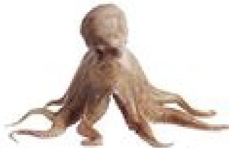
California Two-Spot Octopus