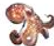
Atlantic Pygmy Octopus