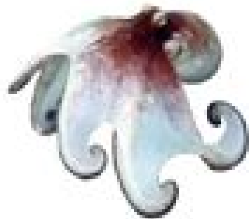
Caribbean Reef Octopus