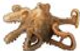
East Pacific Red Octopus