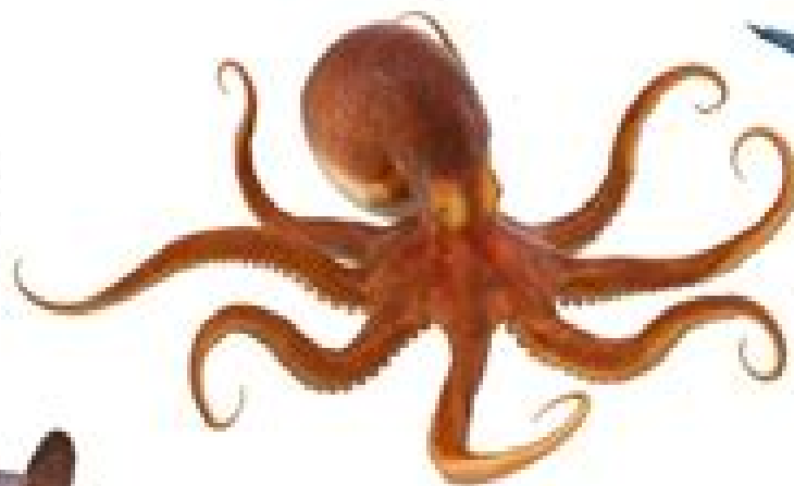
Giant Pacific Octopus