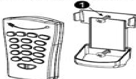
Figure 2 - Mounting

Drill 2 holes in mounting surface, insert wall anchors and fasten the bracket with 2 screws