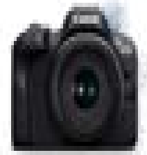
Canon EOS R50 4K video mirrorless camera with RF 18mm f/2.8 STM lens