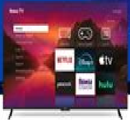
Roku 85" class Select Series 4K smart TV