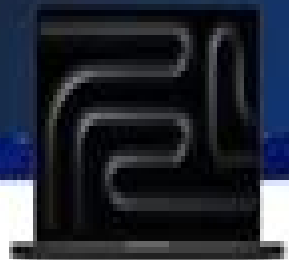
Select MacBook Pro (M4) models