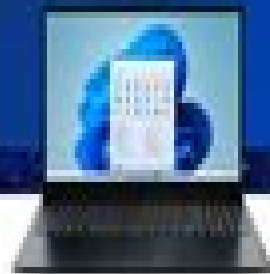
Lenovo ThinkPad T14P Gen 5 Laptop with AMD Ryzen 9 7940 processor and 1TB SSD storage