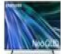
Samsung 85" Neo QLED 4K smart TV