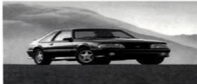
1993 Mustang

Since it was based of the successful Fox Body chassis that includes the Fairmount and the Thunderbird, this allows the 1979-1993 Mustang to share with its older siblings, which is a great benefit to Mustang owners. When the car was new, the sharing allowed Ford to keep the price down, and today gives a bigger choice of parts, but which ones? With Mustang GT Parts Interchange , you will.