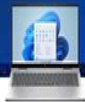
HP Elite 2-in-1 14" Full HD touch-screen laptop with an Intel® Core™ i7 processor and 512GB SSD