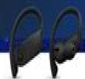
Beats Powerbeats Pro wireless earbuds in black