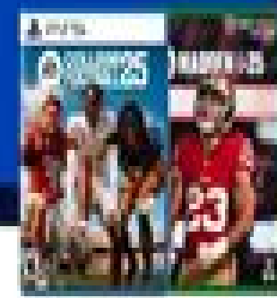
EA College Football 20 or Madden NFL 20