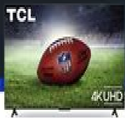
Only at Best Buy TCL 55" class FHD-Series M smart Fire TV

My Best Buy Plus and My Best Buy Total members get Early Access on Nov. 21.