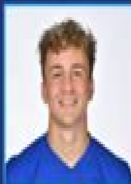
GRIFFIN VOW (F)