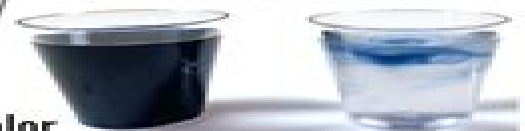
Iodine Clock Reaction