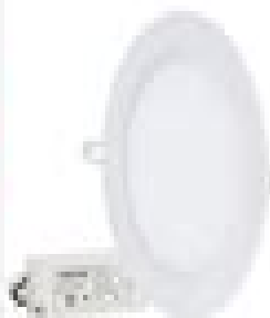
8" Round LED Panel Light