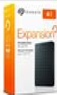
Seagate Expansion 4TB