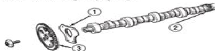
Fig. 19 Camshaft and Sprocket Assembly

NOTE: The camshaft has an integral oil pump and distributor drive gear (Fig. 19).