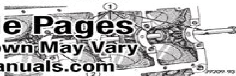
Fig. 18 Camshaft Bearings

(2) Install proper size adapters and horseshoe washers (part of Camshaft Bearing Remover/Installer Tool C-3132-A) at back of each bearing shell. Drive out bearing shells (Fig. 18).