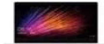
For HP Notebook