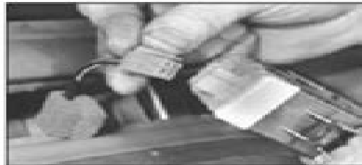
13.2b ... y desconecte el cableado del reloj conector

y retire el panel frontal inferior derecho.