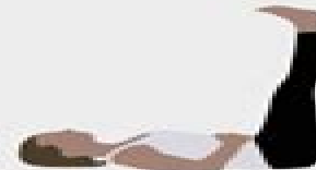
LEGS UP THE WALL