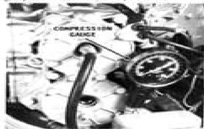
A compression check should be taken in each cylinder before spending time and money on tune-up work. Without adequate compression, efforts in other areas to regain engine performance will be wasted.

Remove the spark plug wires. ALWAYS grasp the molded can and pull it loose with a