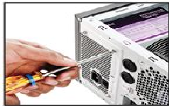
1 Install the power supply