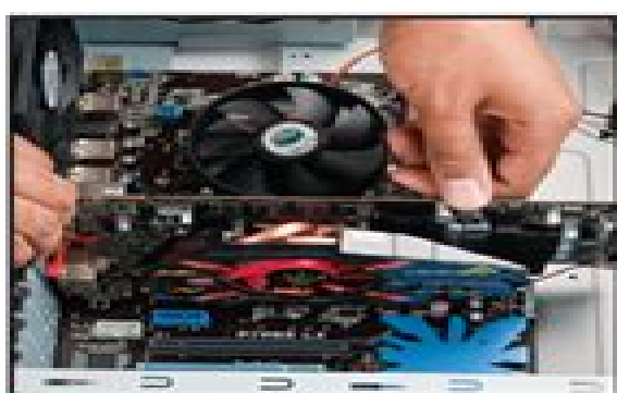
8 Install the graphics card