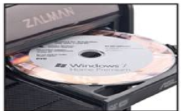
9 Install the operating system