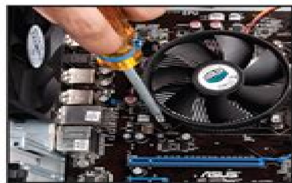
4 Mount the CPU cooler