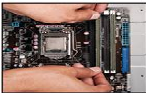
5 Install the RAM