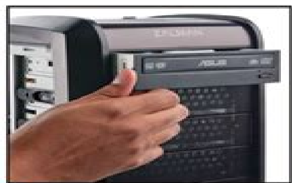
7 Install the optical drive