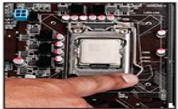
3 Install the CPU