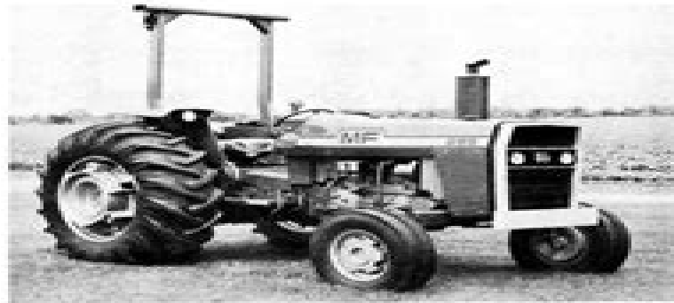
MF 285 TRACTOR