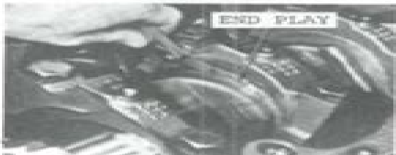
Fig. 37—Crankshaft end play should be within limits of 0.05-0.38 mm (0.002-0.015 inch).

Note that main bearing caps are not interchangeable. Caps are numbered 1 through 5 from front to rear and are also marked with a cylinder block identification number that must match number stamped on bottom of cylinder block. Recommended tightening torque for main bearing cap screws is 230-244 N·m (170-180 ft.-lbs.). Refer to paragraph 37 for installation procedure for rear seal