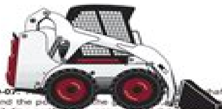
FIG. 2D-07: Insert the injection pump so that the notch line on the rear circumference of the injection pump gear is aligned with the mark shaped like an arrow point over the opening in the gear case. Dead Center.

Remove bolts holding injection pump to timing gear case and remove injection pump assembly. Install injection pump as follows: