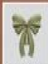
Green Cottage Bow