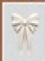
White Cottage Bow