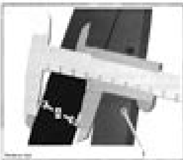
1. Drive pulley cover 2. Pry bar or screwdriver