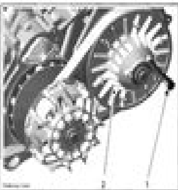
1. Drive pulley cover 2. Pry bar or screwdriver

To remove belt no. 4, slip the belt over the top edge of sliding rail, as shown.