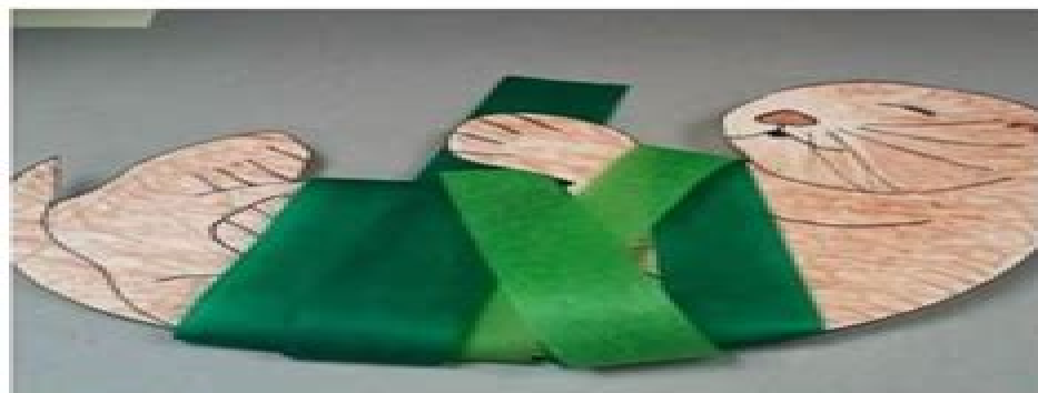
Sea Otter Paper Bag Puppets with free printable templates!