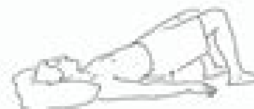
TRUNK STABILITY - 4 Bridging

Slowly raise buttocks from floor, keeping stomach tight