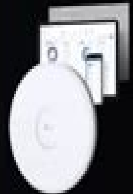
Omada Enterprise Wi-Fi 7 Access Points