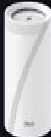
Deco Whole Home Mesh Wi-Fi 7