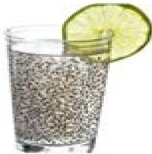
Chia Seeds Water