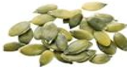
Pumpkin Seeds 1 TSP