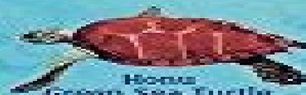
Honu Green Sea Turtle

Area: 597 sq. mi. (1557 sq. km) Coastline: 112 mi. (180 km) Size: 60 mi. (97 km) wide x 30 mi. (48 km) high Population: 900,000 + (400,000 in Honolulu) High Spot: Kaala, 4020 ft (1225 m) Rainfall: Honolulu Coastal - 22 in. (56 cm)/yr Kailua - 75 in. (193 cm)/yr Mountains - 80 to 200+ in. (508+ cm)/yr