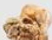
CHICKEN WITH DUMPLINGS AND VEGETABLES