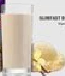
SLIMFAST DIABETIC WEIGHT LOSS Vanilla Whitehouse Shake Mix