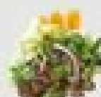
HAMBURGER CHEESE STEAK SALAD