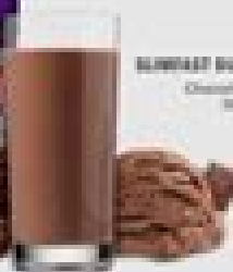
SLIMFAST DIABETIC WEIGHT LOSS Chocolate Whitehouse Shake Mix