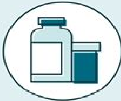
Administration of medication