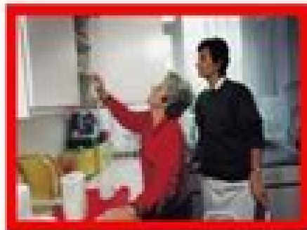
Range of Motion