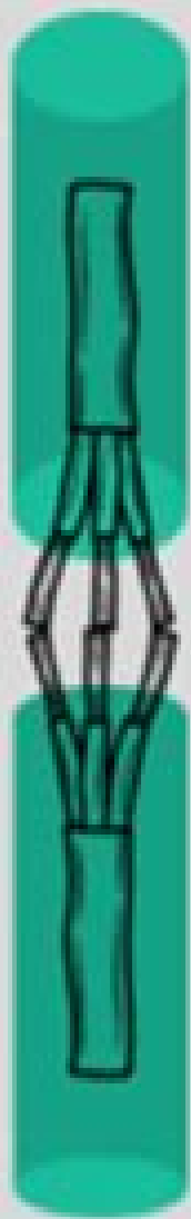
Direct Nerve Repair