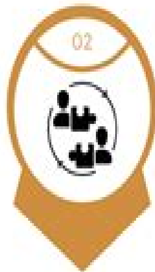
Collaborative Negotiation Games