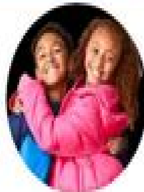
Kids & Baby