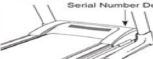
Serial Number Decal

Find the serial number in the location shown below. Write the serial number in the space above for reference.