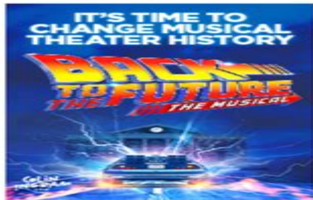
Plays on Broadway