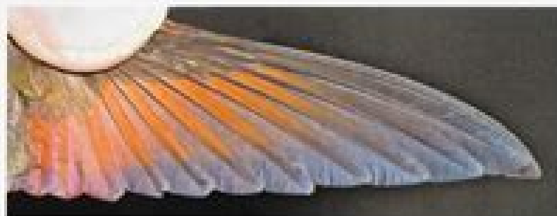
Adult male wing. The wing of the male shows more rusty orange than that of the female, extending into the ninth primary (p9) and almost to the tip of p1 and the first few secondary wing feathers.