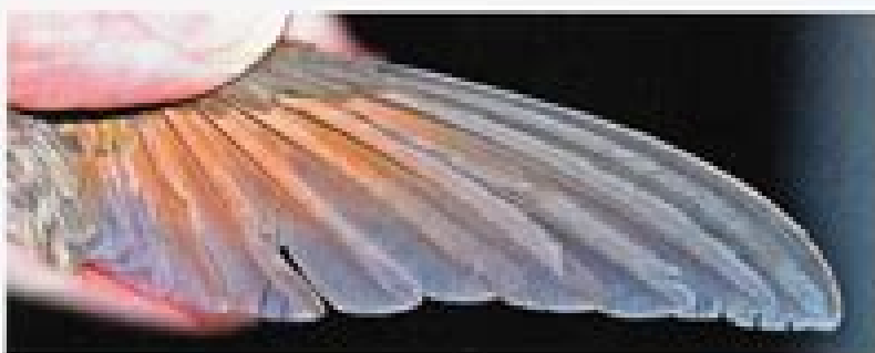
Adult female wing. The wing shape and coloration are also similar to those of the male, but the extent of rusty orange is less than in the male's wing. The underwing rusty cinnamon color is also slightly subdued in the female, although it is still very evident.