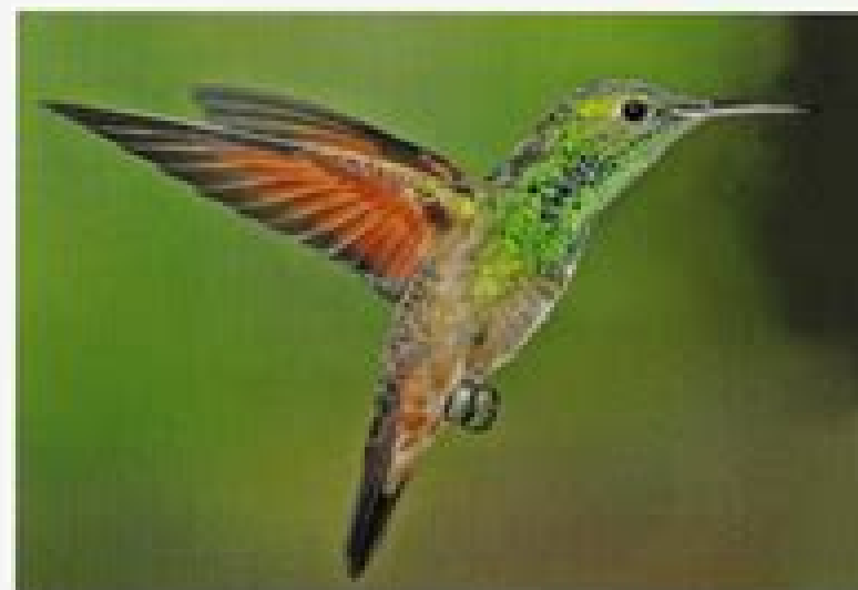
In good light, it is easy to see the solid-green head, neck, gorget, and breast of an adult male. Note the bright cinnamon underwings and the cinnamon on the undertail coverts.