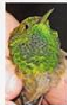
This is the same bird as in the previous image, from a different angle. Now the gorget is a much darker green and has a hint of dark blue. Note that the belly is cinnamon buff.