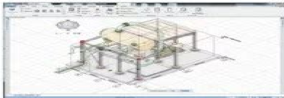
Cost lines, driven parts and annotations can all be viewed in the 3D view

AVEVA E3D readily integrates with other AVEVA products, providing extensive functionality for Integrated Engineering & Design. But AVEVA's open design also facilitates information exchange with many third-party systems, enabling it to be implemented into existing technical infrastructure with minimal risk.