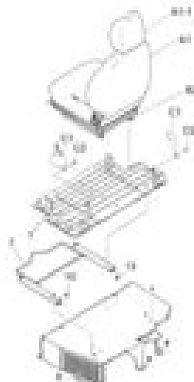
Fig. 33-1 Disassembling and Assembling seat