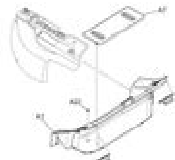
Fig. 33-3 Disassembly and assembly of cover (A7) and cover Assy (A7)