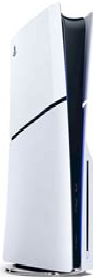
PlayStation 5 Slim