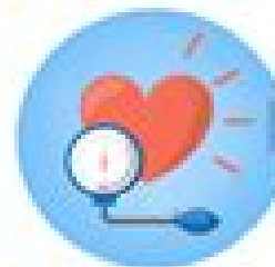
HIGH BLOOD PRESSURE