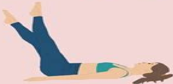
5. THE HUNDRED