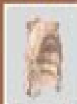
Preppy Buns Hair (Blonde)