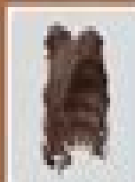
Preppy Buns Hair (Brown)